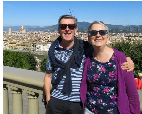
From Piazzale Michelangelo, with Florence behind us.